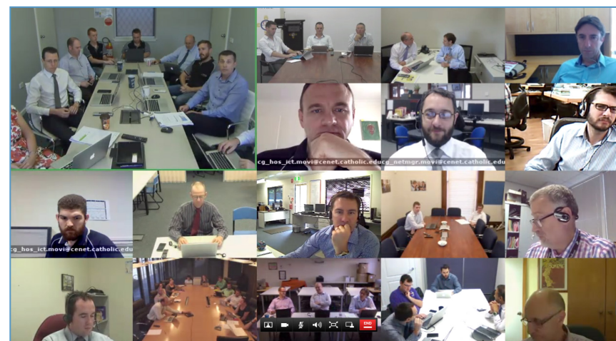
COG video conference with participants in the ACT, NSW and QLD