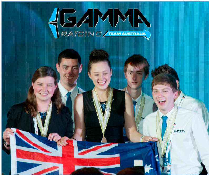
The Gamma Raycing Team from Magdalene Catholic High School

The connected world is providing CEnet Member Dioceses with opportunities to enhance learning experiences in an ever increasing range of exciting ways.