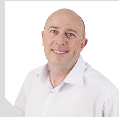
FROM THE CEO

I would like to thank the Board for their support throughout 2014 and acknowledge the ongoing contribution and support of the Members of the CEnet