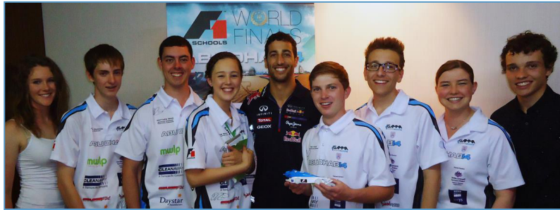
Team with Daniel Ricciardo